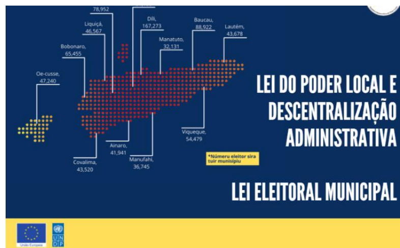
Figure 3: Supporting Materials on the Decentralization Laws