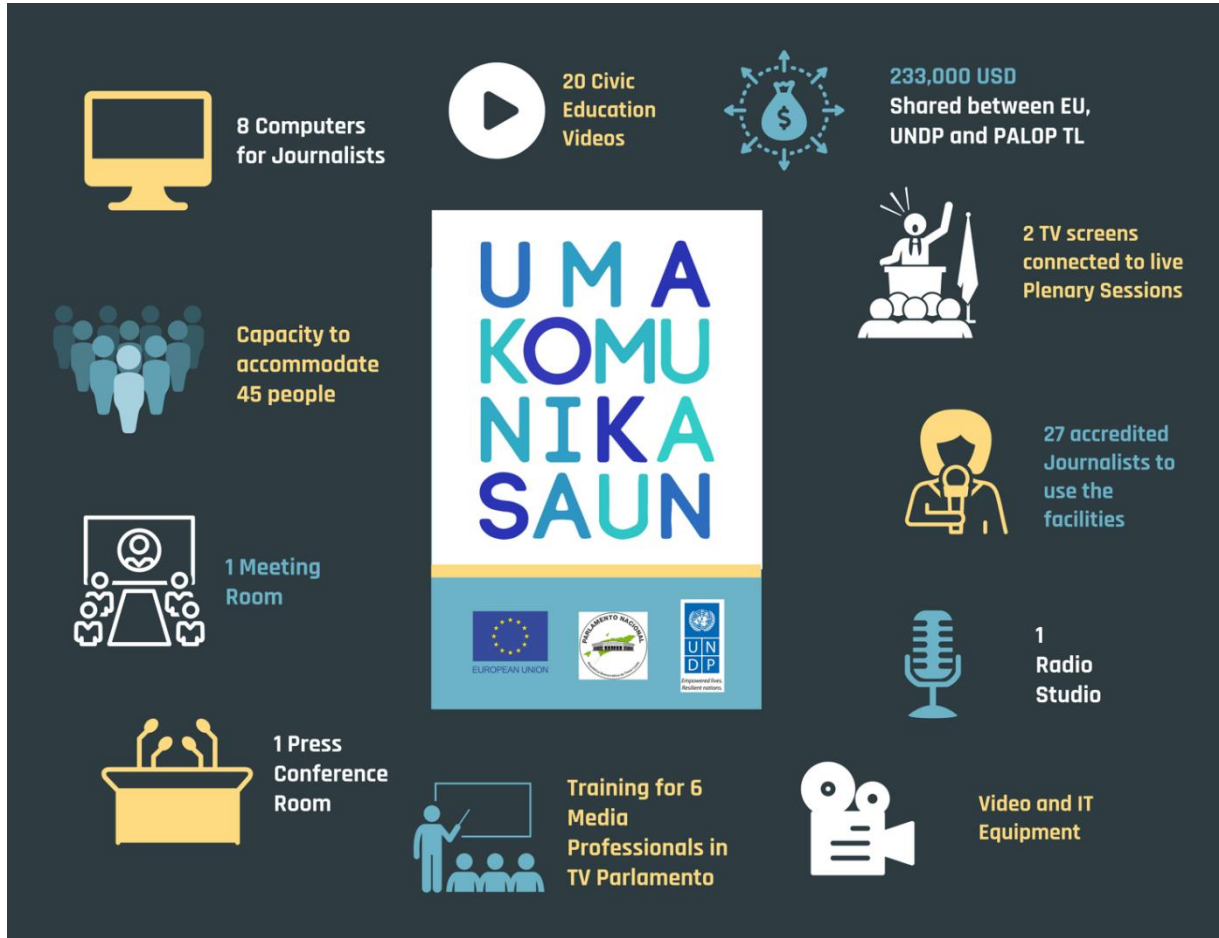
Figure 2: Infographic on Uma Komunikasaun